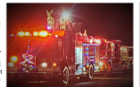
Please give generously

Non-perishable food items can be brought to City Hall anytime