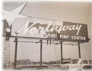
Northway Shopping Center