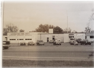
Lexington Fire Department