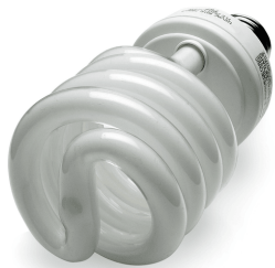
Fluorescent CFL & HID Bulbs NO TUBES