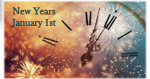
New Years January 1st