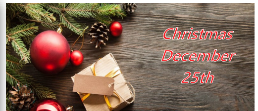
Christmas December 25th