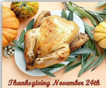
Thanksgiving November 24th